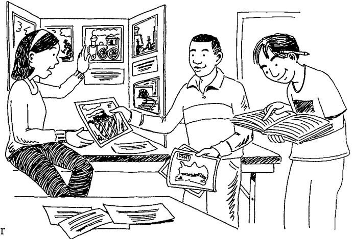
Chart your course

Share with your teen these steps for working effectively in groups.